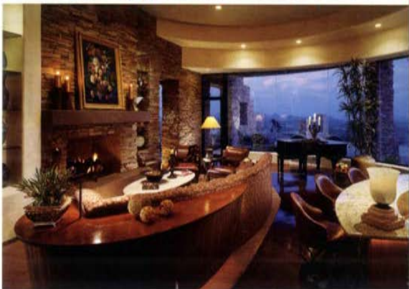
Opposite page: This Arizona bedroom relies on curved lines to create interest and comfort.