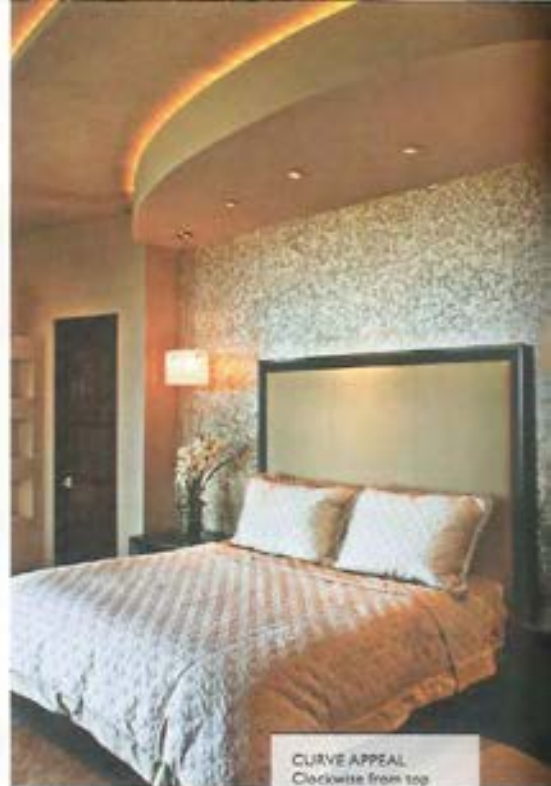
CURVE APPEAL Clockwise from top left: Zebrawood cabinetry, black granite countertops and modern art create a striking setting in the kitchen; an illuminated soffit and mother-of-pearl wallcovering create a luxurious alcove in the master bedroom; a steel-clad fireplace and a curved desk with a view mark the home office.