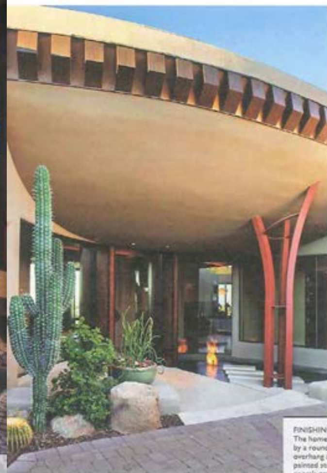
FINISHING TOUCHES From left: The home's front door is shaded by a rounded copper-trimmed overhang and supported by a painted steel column; the great room's granite slab fireplace provides a warm backdrop for a custom sofa and silk area rug.