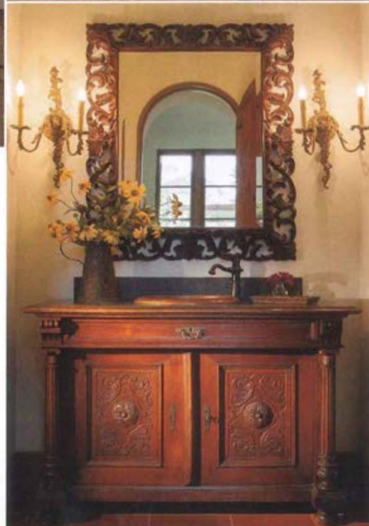
Top left: Designed to mimic the feel of a castle, this powder room bathes guests in Old World charm and rich, classic materials. With curved walls clad in stone, a soaring ceiling, arched teakwood-framed windows and reclaimed limestone paver flooring, it is packed with high-end finishes. Design details include a layer of brick that caps the walls, a custom-made primavera wood vanity, and an antique mirror perched on the window ledge.